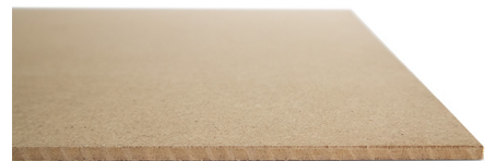
High-density fibreboard (HDF)