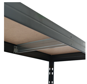
Crossbeam undershelf support